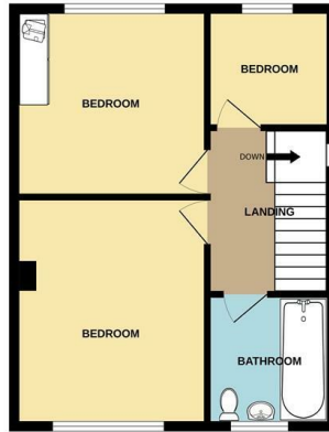
1ST FLOOR 436 sq.ft. (40.5 sq.m.) approx.